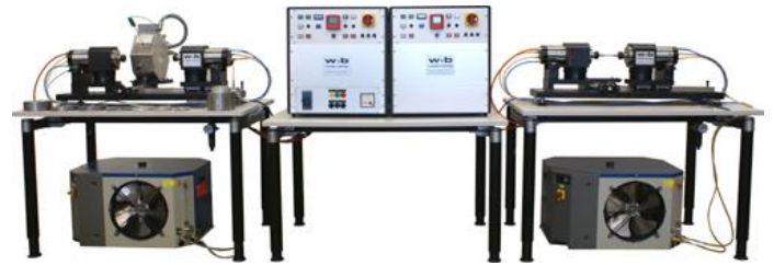
Walter + Bai AG

There are even test benches at IBAG in use. Those are completely designed and built at IBAG. On these test equipments the operator has the possibility to select the motor currently connected by the operator panel. All medias