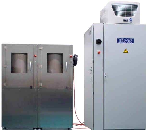
Kistler Instrumente AG

these applications IBAG is providing complete solutions according the customers' requirements.