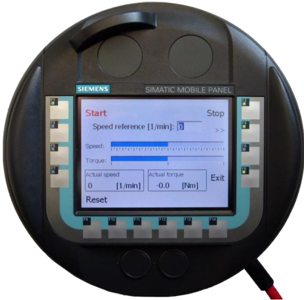
HMI for Kistler Instrumente AG

rience. Do you have a test bench already, but does not fulfill today's requirements? Please ask, what solution we can offer. Even existing test benches can be modernized and brought up to the current state of the art.